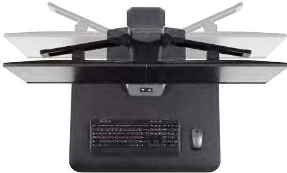
Focal depth adjustment allows users to easily position monitors to a comfortable viewing distance.