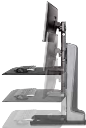
Electric height adjustment makes going from sitting to standing effortless.