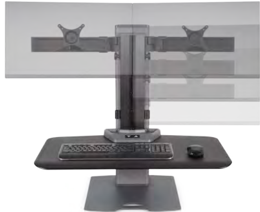
Independent movement of the monitors lets users keep each monitor at a comfortable, ergonomic level.